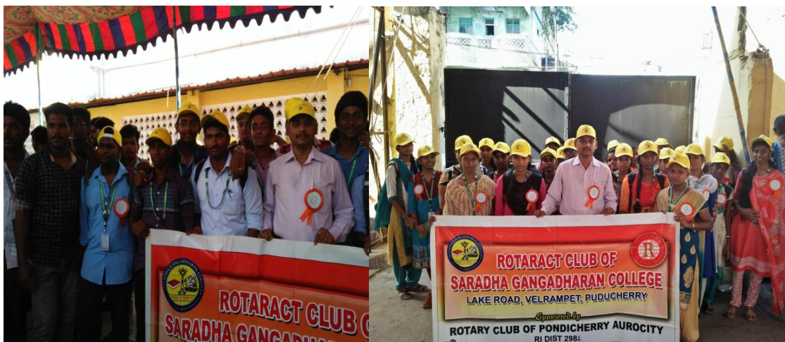
Awareness rally on Eye Donation

The rally started off from Raja Theatre Signal to Mahatma Gandhi Statue, Beach road. More than 100 students pronounced the slogan for awareness for eye donation.