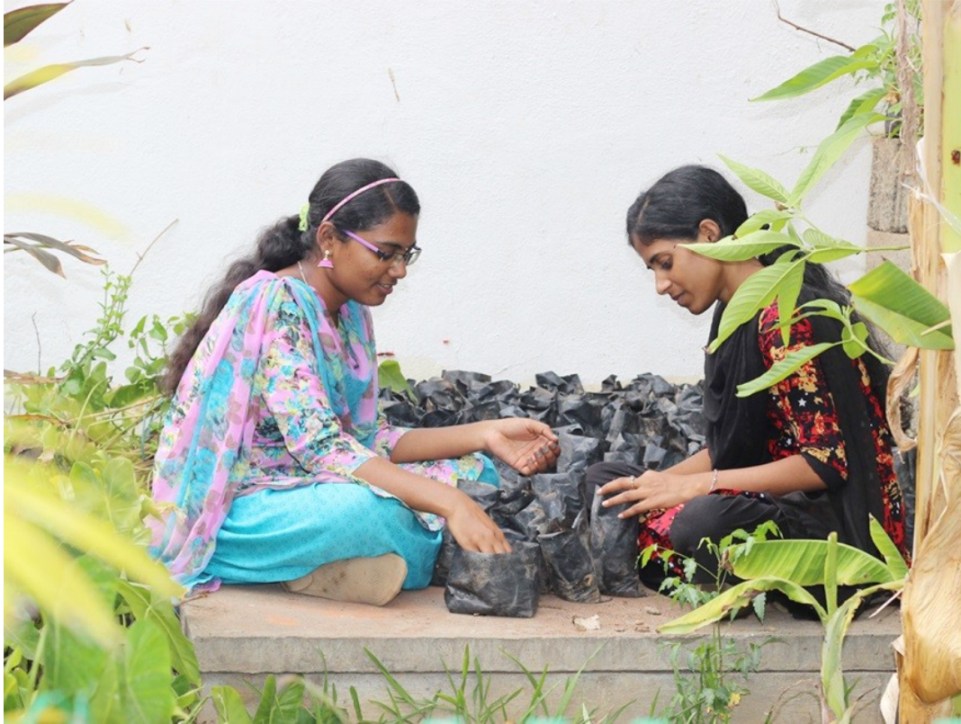
Noxious Weed Removal Unit (15.07.2017)