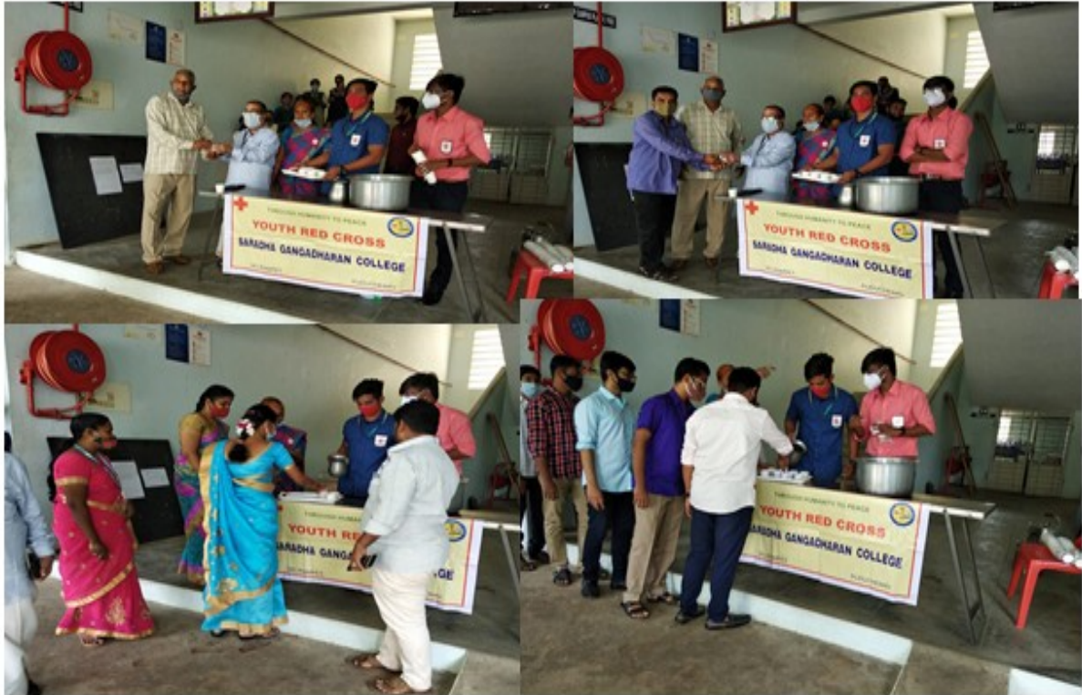
Ministry of Labour Welfare, Puducherry organized Mega Job Mela at Annai Sivagami Government Govt. Hr.Sec. School, Muthaliarpet on 24 th January, 2021. 15 YRC students from our college done voluntary work in this program.